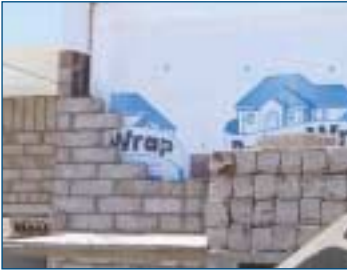
Rufco-Wrap used behind brick.

The right balance – Rufco-Wrap is slightly more breathable than standard Grade D building paper, reducing the inward movement of solar-driven moisture.