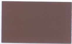
SR-11 CEDAR BROWN