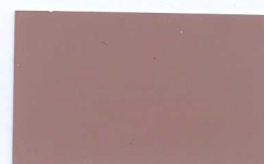
SR-08 SUBTLE ROSE