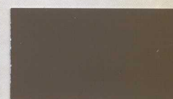
SR-12 DARK BROWN