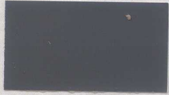
SR-19 DARK GRAY

STAMPCRETE Powdered Release Agents are a dry blend of chemical powders and color pigments, used to achieve accent colors and various color variation to textured surfaces in decorative stamped concrete. STAMPCRETE Release Agent allows the clean release of decorative stamps from the concrete surface by acting as a barrier between the concrete and the texturing tools.